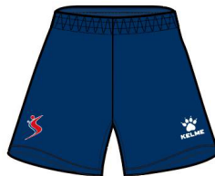
ASA Special Edition Uniform