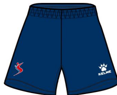
ASA Special Edition Uniform