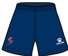
ASA Special Edition Uniform